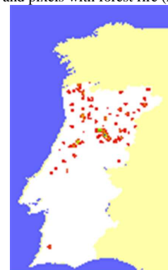
Figure 2 - Forest fires map from January to September 2015, based on FRP-Pixel LSA SAF product. MSG resolution and colours indicating ocean (cyan), Spain (yellow), pixels without forest fire (white) and pixels with forest fire (red).